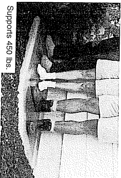
Supports 450 lbs.